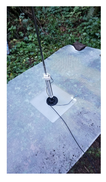
Setting up the vertical on a ground "screen" It worked for us quite nicely.

Here is an interesting video by kb9vbr demonstrating how the aluminum window screen works quite nicely: